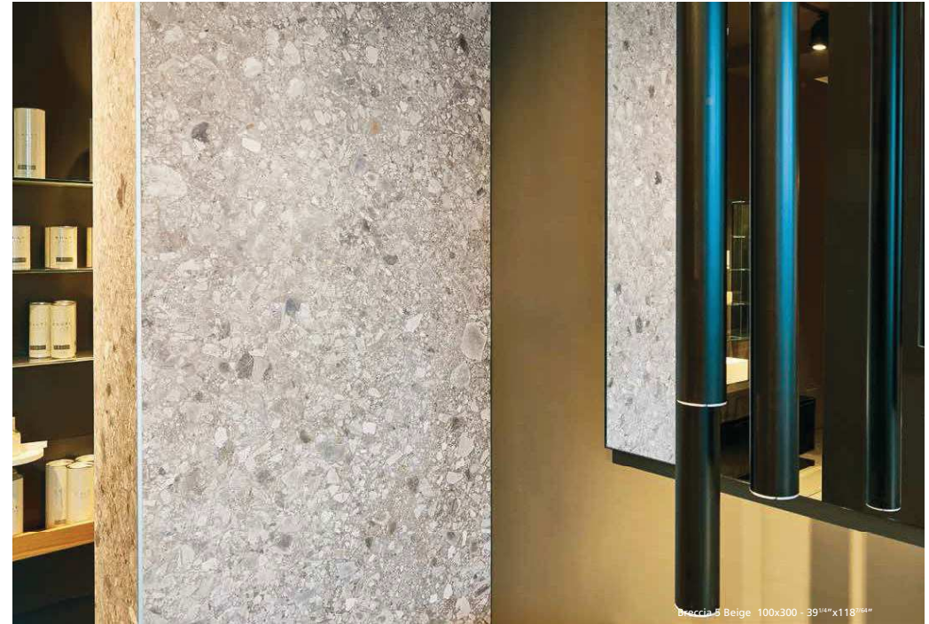
Breccia 5 Beige 100x300 - 39 1/4 "x118 3/16 "

Breccia 5 Grey 100x100 - 39 1/4 "x39 1/4 " 63 50x150 - 19 3/4 "x59 1/16 " 63 100x300 - 39 1/4 "x118 3/16 " 63