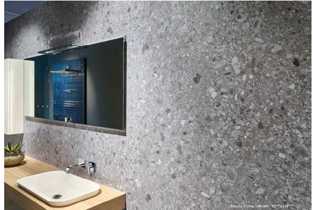
Breccia 5 Grey 100x300 - 39 1/4 "x118 7/16 "