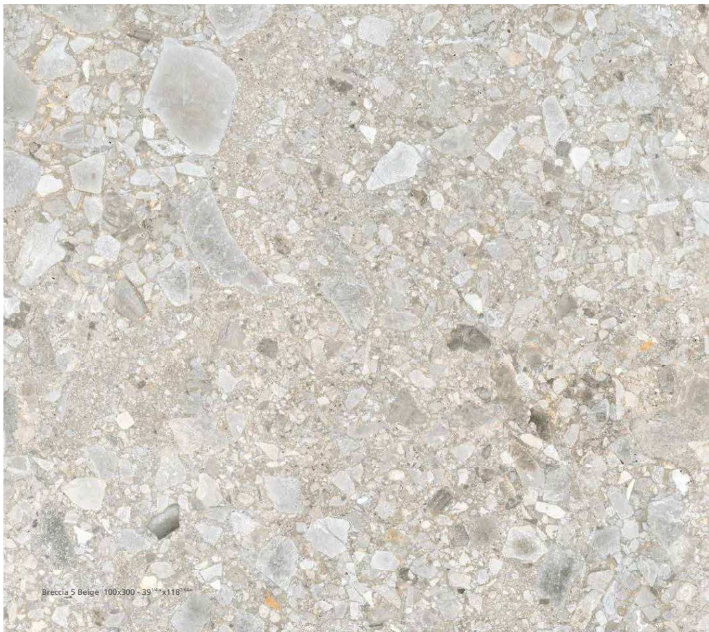
Breccia 5 Beige 100x300 - 39 1/4 "x118 1/4 "