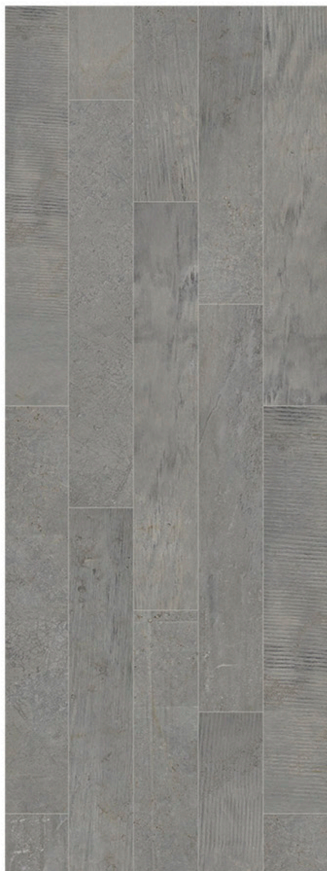
COD. S29502 Grigio