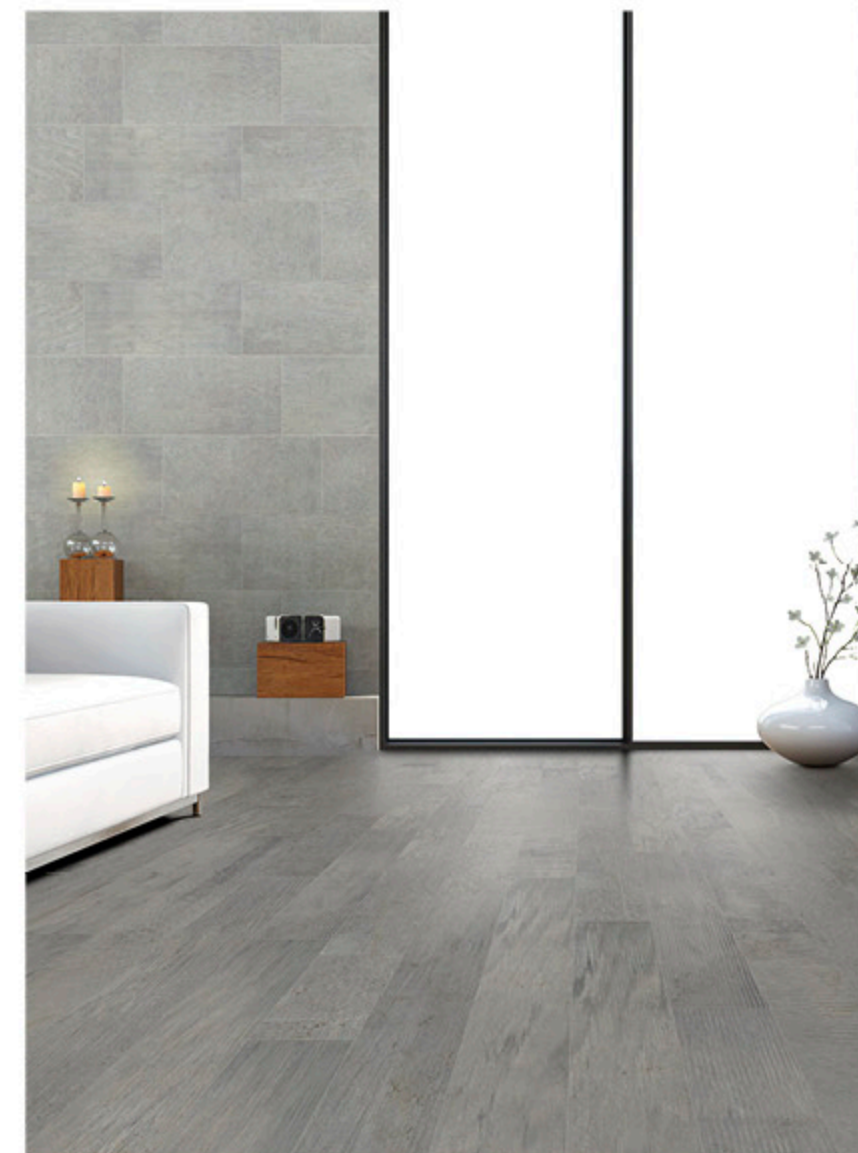
Floor = Inkside 15,3x100 Grigio | Wall = Inkside 30x60 Perla