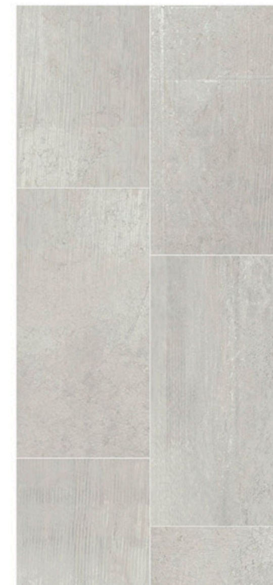
COD. S10500 Bianco