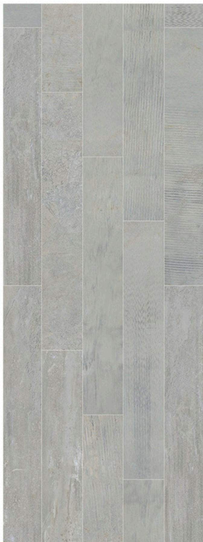
COD. S29501 Perla