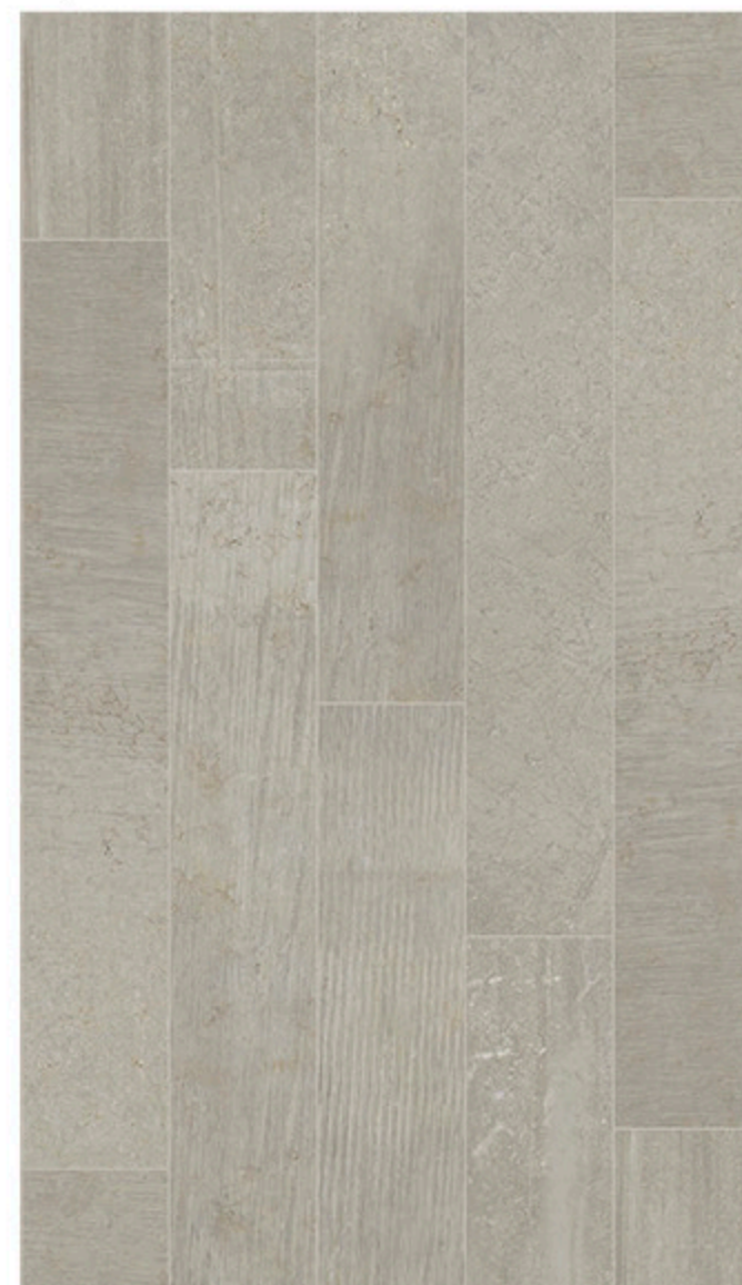
COD. S29503 Taupe