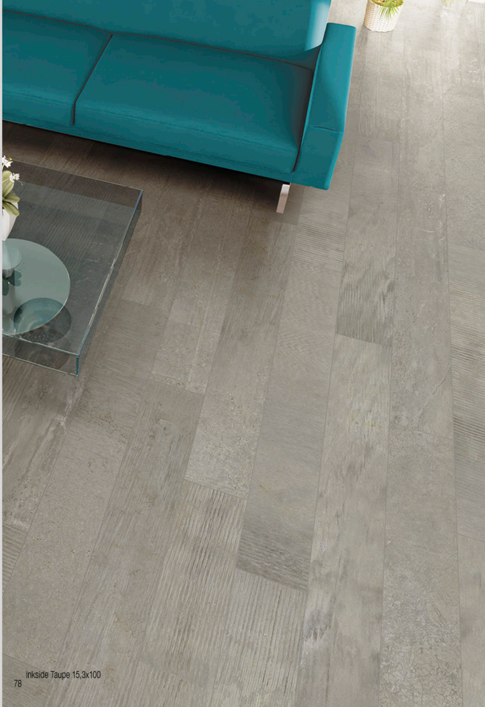
Inkside Taupe 15,3x100