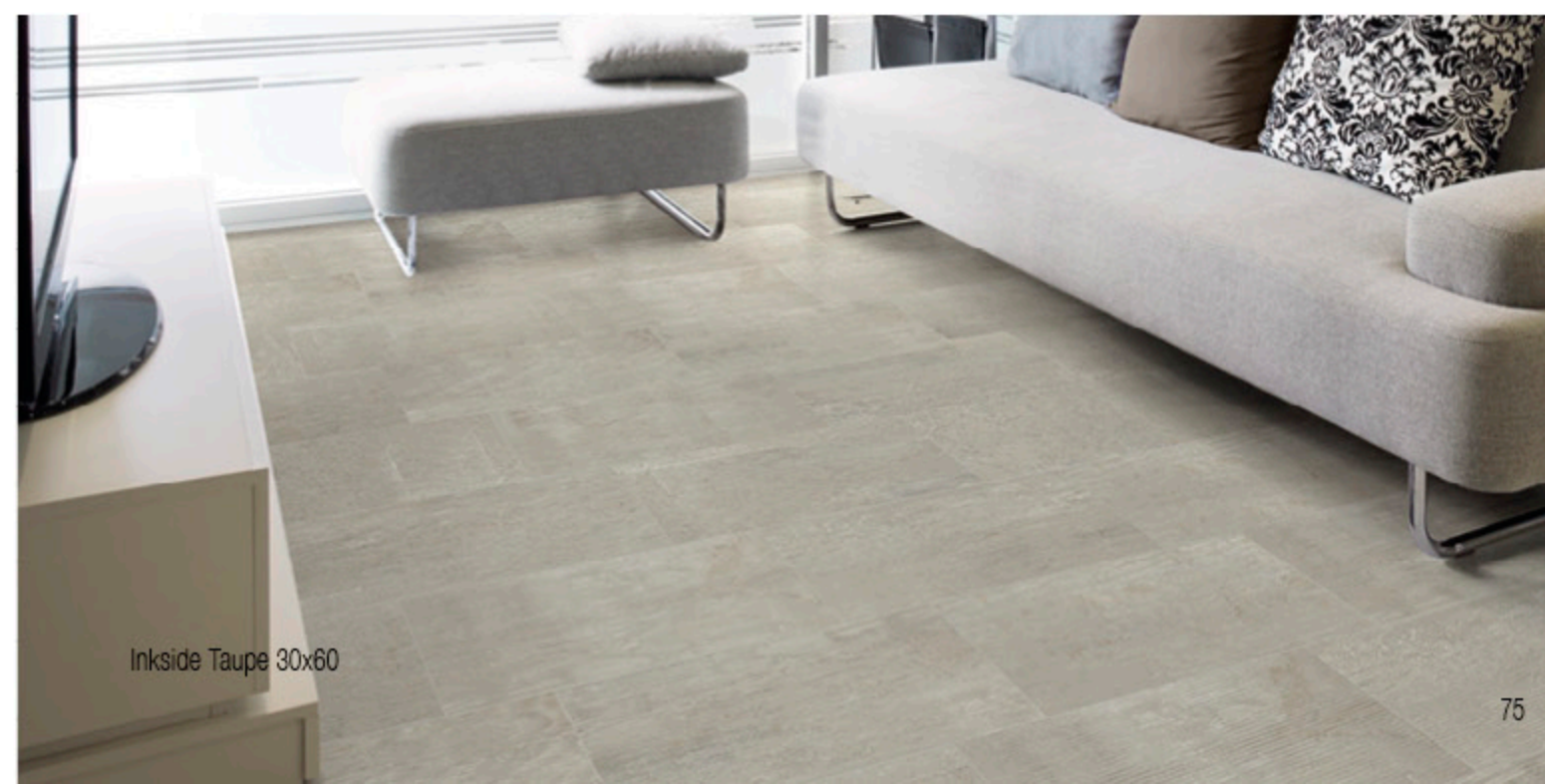
Inkside Taupe 30x60