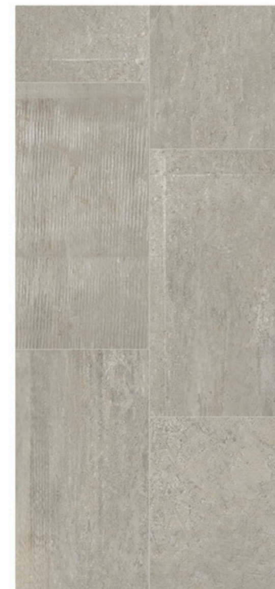
COD. S10503 Taupe