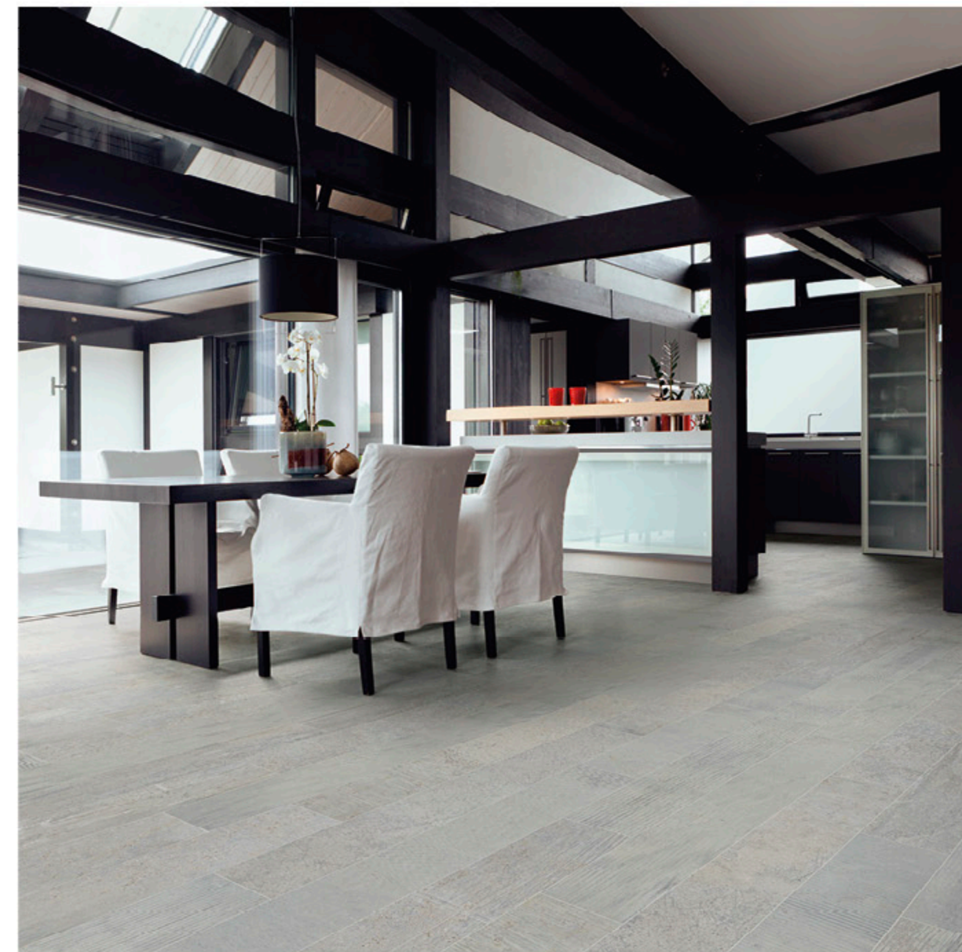
Inkside Perla 15,3x100