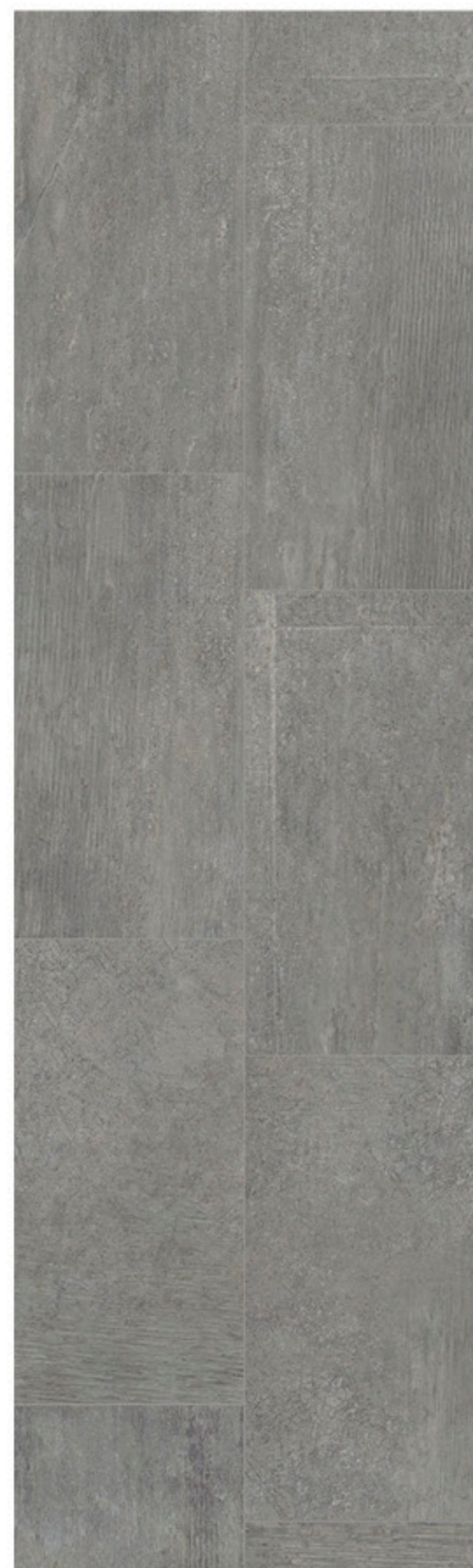
COD. S10502 Grigio