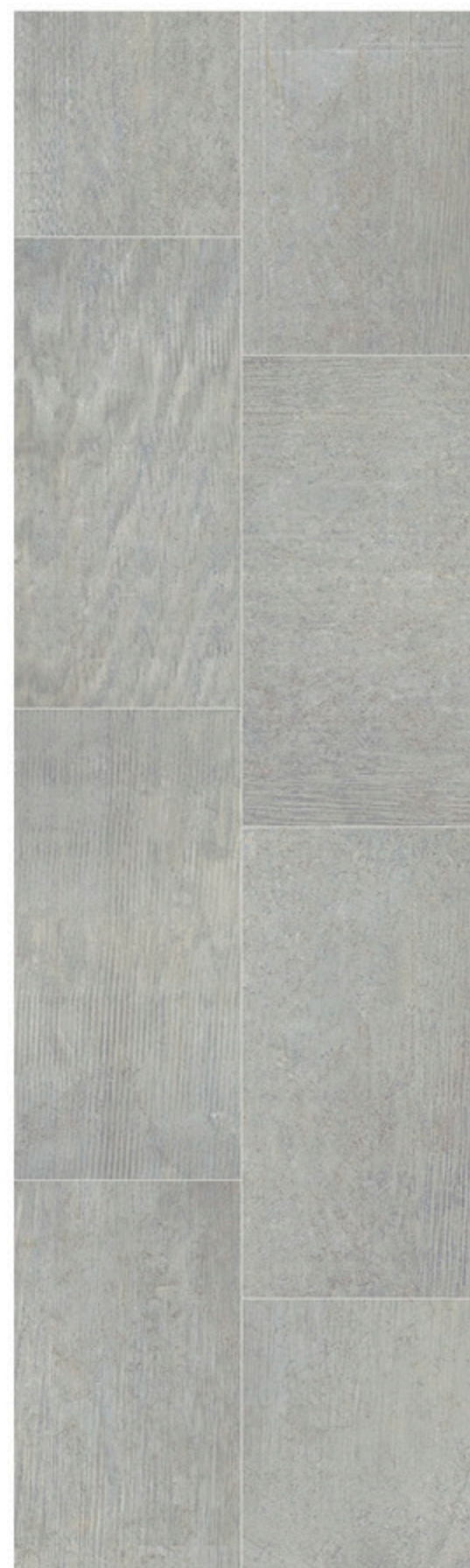
COD. S10501 Perla