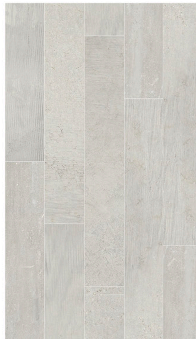
COD. S29500 Bianco