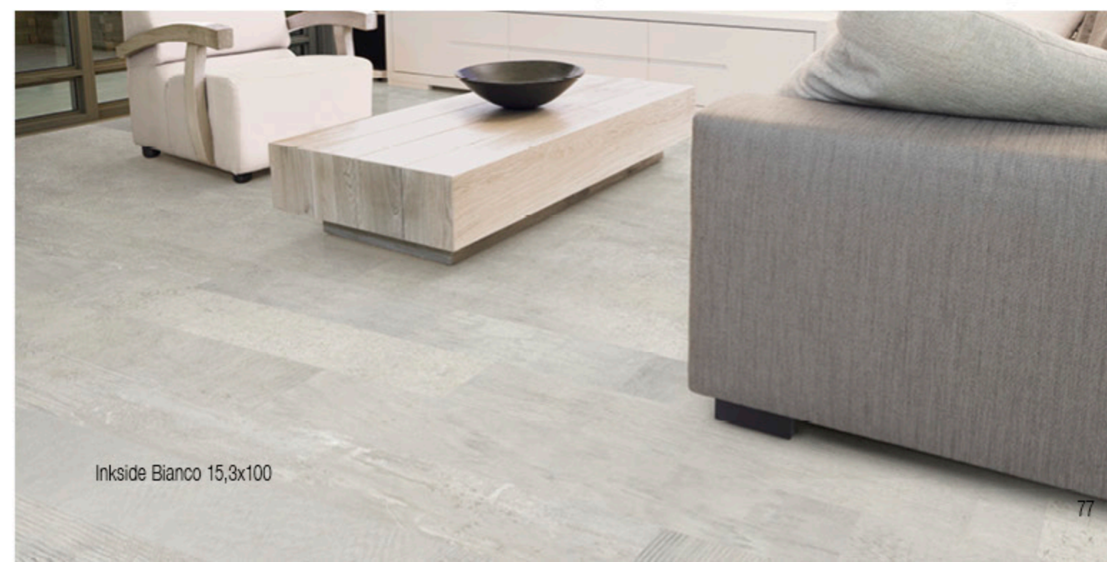
Inkside Bianco 15,3x100