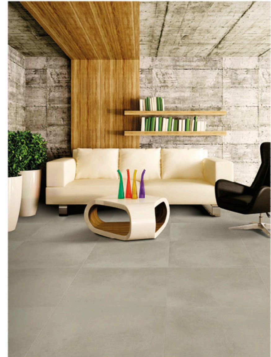
Flint Mole 52x52