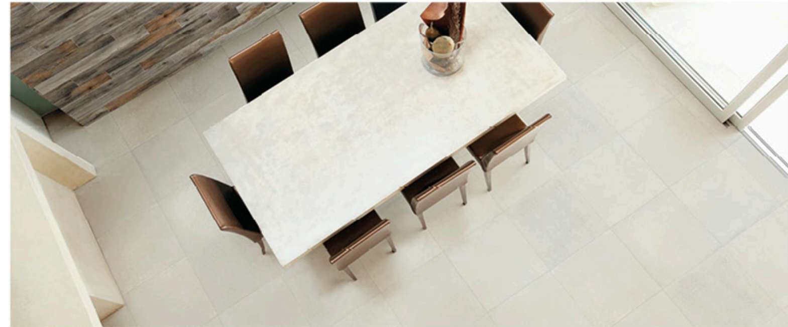
FLOOR = Flint 60x60 Sand Rettificato | WALL = Vintage Marrone 20x120