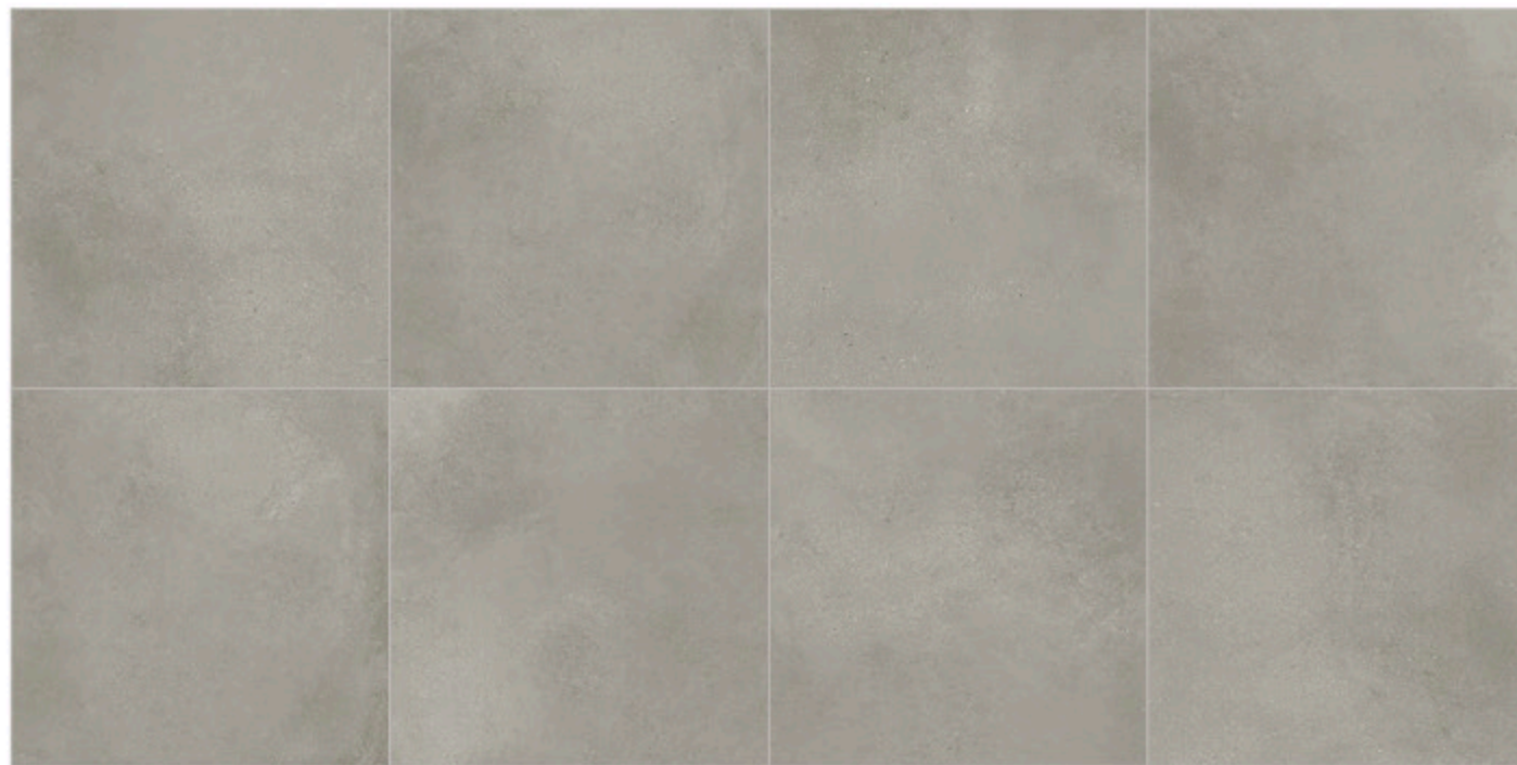
Flint 60x60 Grey Rettificato