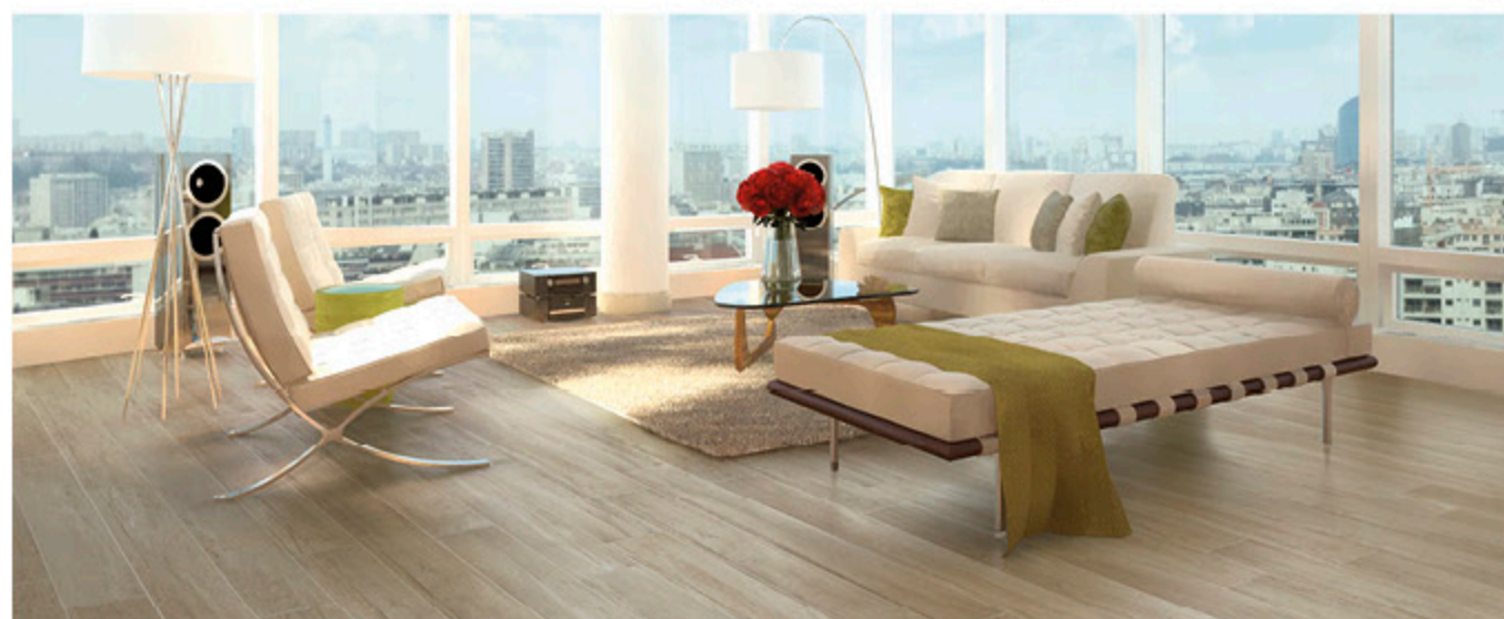
Avana Beige 20x120