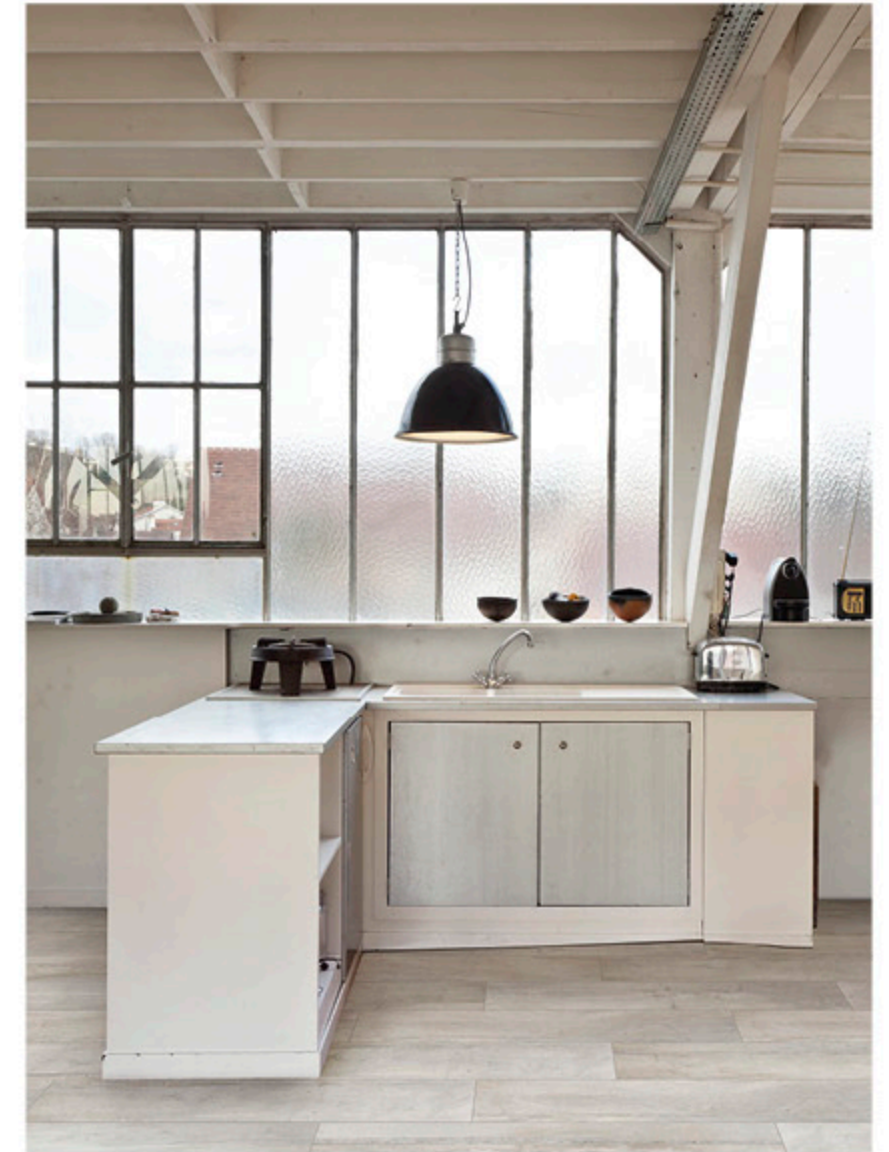
Avana Grigio 20x120