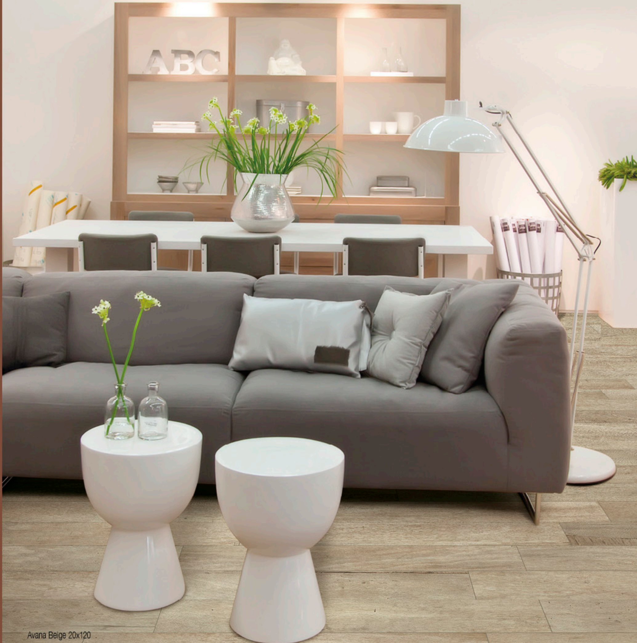
Avana Beige 20x120