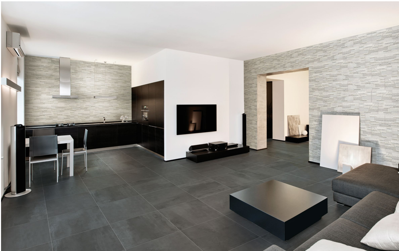
Setting made by: WALL = Architettura Cemento 21,6x43,5 / FLOOR = Loft Antracite 52x52