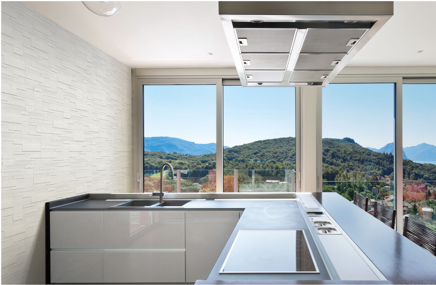
Setting made by: Architettura Bianco 21,6x43,5